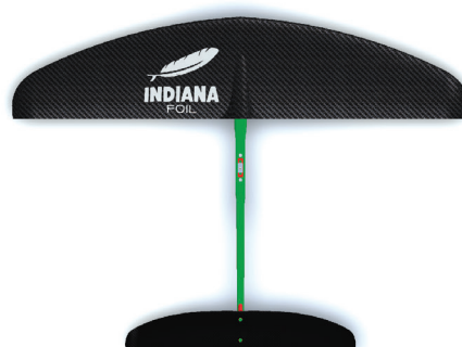
LONG Fuselage Length

Maximum pitch resistance Highest stability Maximum yaw resistance