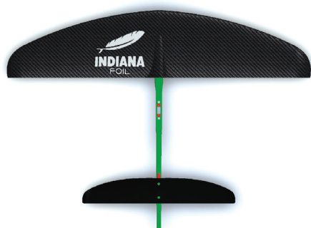
SHORT Fuselage Length

Maximum looseness Highest turning speed Best pump performance