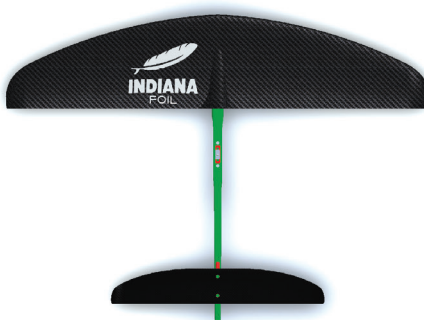
STANDARD Fuselage Length

A good balance between stability and performance